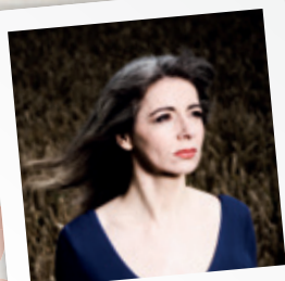
Percussion: Evelyn Glennie

Find a concert you like and experience the unique sounds of the Singapore Chinese Orchestra! Visit us at www.sco.com.sg !