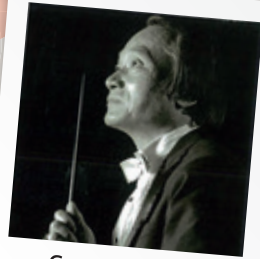
Guest Conductor: Chen Tscheng-Hsiung