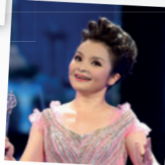
Soprano: Wu Bixia