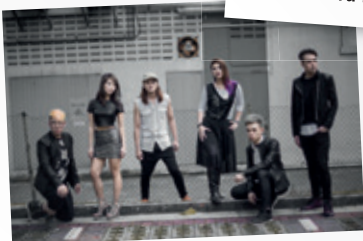
Vocal Band: MICappella